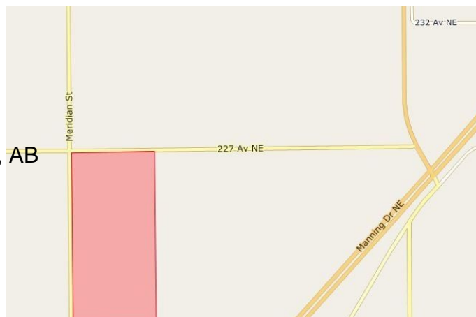
Edmonton Energy and Technology Park

This eighty (80) Acres parcel within city of Edmonton limit is located along Meridian Street and 227 Avenue. This agricultural land is just off the Manning Drive and is in the heart of Edmonton Energy and Technology Park. There is upside as this developmental opportunity is identified as potential "Research and Development" zoning in proposed Edmonton Energy and Technology Park. There is a Three (3) bedroom house on the property and the rest of the land is under farming.